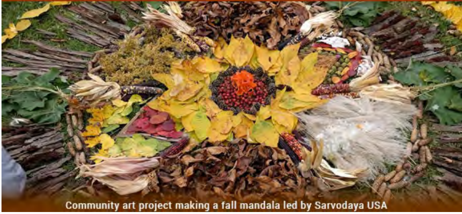
Community art project making a fall mandala led by Sarvodaya USA